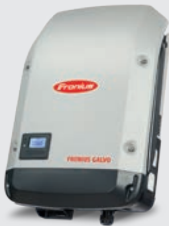
/ FRONIUS GALVO 1.5 - 3.1 kW 1-phase

perfectly optimised for your self-consumption system. Now, for the first time, the inverters are also equipped with a WLAN interface inside the device. Your photovoltaic system is therefore wirelessly connected to the internet so you can call up your system data whenever you want.