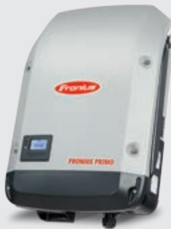
/ FRONIUS PRIMO 3.0 - 8.2 kW 1-phase