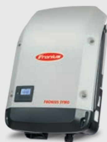
/ FRONIUS SYMO 3.0 - 20.0 kW 3-phase